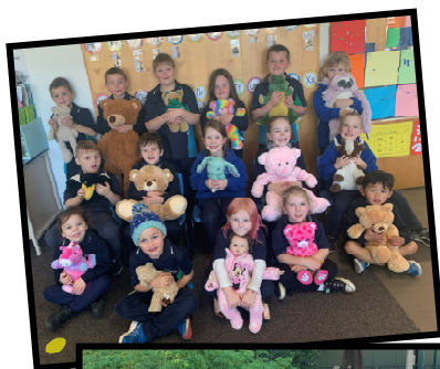
Teddy Bears Picnic