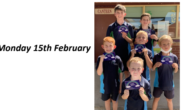
Monday 15th February