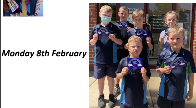
Monday 8th February