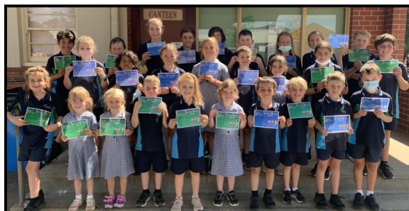
Monday 1st March