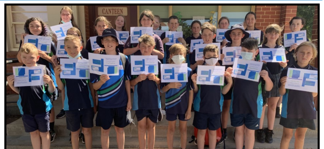
Sports, Visual Arts, Performing Arts, Canteen and Canteen Order Leaders