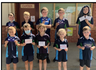
Monday 21st February