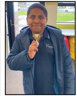
Monday 30 th June