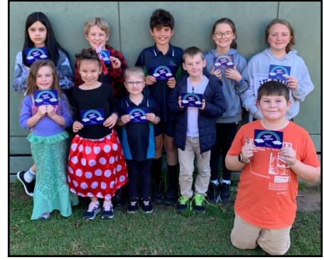
Monday 23 rd May