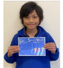
Monday 25 th July