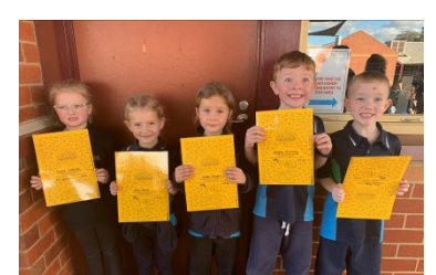
Monday 1st August